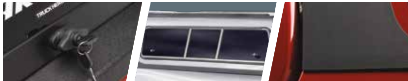
SINGLE T HANDLE