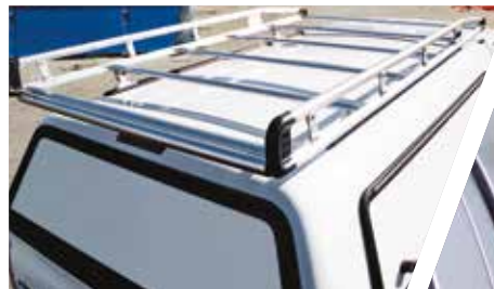
ALURACK® COMMERCIAL LADDER RACK