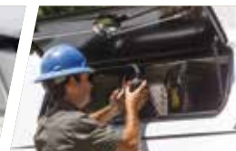
OPTIONAL DIAMOND PLATE TOOLBOXES (DEPTH 12"-16") DEPENDING ON TRUCK MODEL