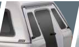
OPTIONAL FIBERGLASS WALK-IN REAR DOOR