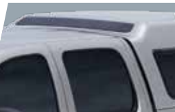
FRONT VISTA GLASS (NOT A SKYLIGHT)