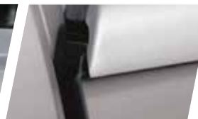
EXTRA WIDTH AT FRONT CORNERS