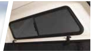
INTERIOR FIBERGLASS FINISH