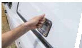
OPTIONAL ALUMINUM PANELED WINDOORS WITH FOLDING T-HANDLES