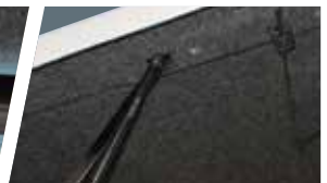
DARK GRAY HEADLINER