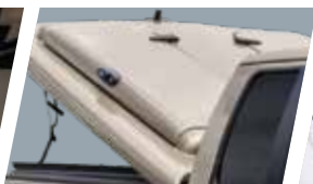
ENTIRE COVER OPENS