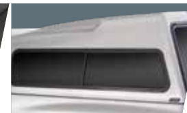
ALUMINUM FRAMED HALF SLIDER WINDOW