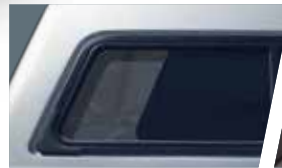
ALUMINUM FRAMED HALF SLIDER W/ CORNER FASCIA