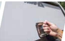
OPTIONAL ALUMINUM PANELED REAR DOOR WITH FOLDING T-HANDLES