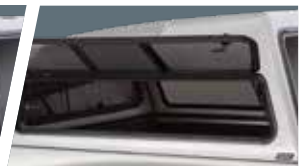
OPTIONAL OUTDOORSMAN VENTED WINDOW