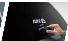
FRAMELESS DOOR WITH CONTOUR STRIP