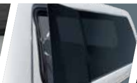
SCREEN VENT SIDE WINDOWS