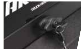
SINGLE T HANDLE

AERODYNAMIC DESIGN HELPS IMPROVE FUEL ECONOMY.