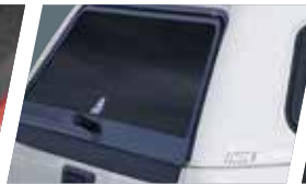
ALUMINUM FRAMED SINGLE T DOOR