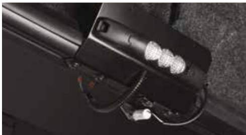
12V LED DOME LIGHT WITH ACTIVETILT™