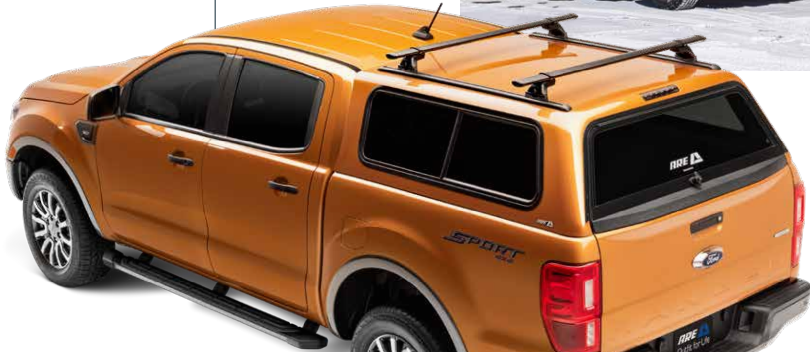
SHOWN WITH OPTIONAL YAKIMA COREBAR ROOF RACK