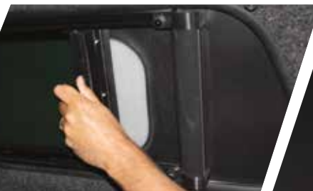
OPTIONAL RETRACTABLE SCREEN