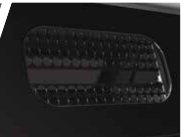
OPTIONAL PET SCREEN