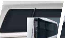
OPTIONAL SCREEN VENT WINDOW Not available on all truck makes/models