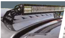
OPTIONAL RIVAL™ LED LIGHT BAR (REPLACES FRONT VISTA GLASS)