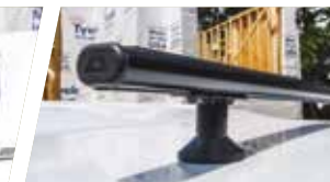
OPTIONAL HD SERIES ROOF RACK (ONLY RACK WITH 550LB WEIGHT RATING)

FOR MORE INFORMATION, REFER TO MODEL SPECIFIC SPECIFICATIONS. (PAGE 30)