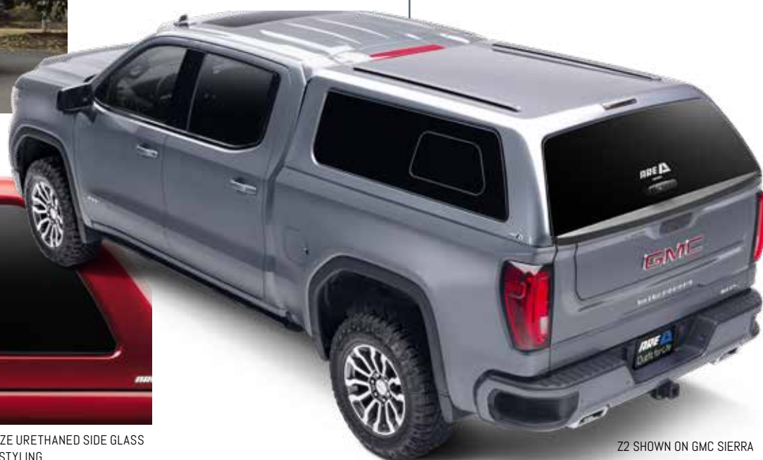
Z2 SHOWN ON GMC SIERRA