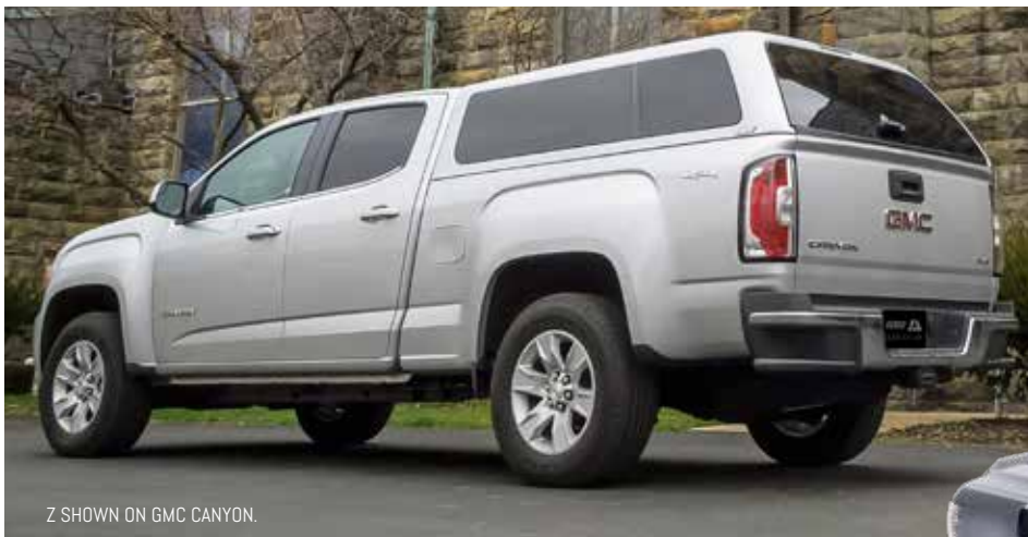
Z SHOWN ON GMC CANYON.