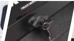
SINGLE T HANDLE