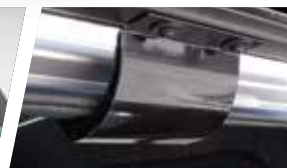
HIDDEN HINGE SYSTEM