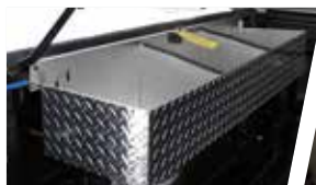
OPTIONAL DIAMOND PLATE TOOLBOX