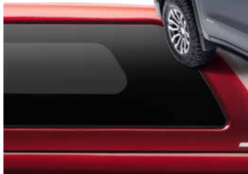
Z2 MODELS THAT ARE AVAILABLE UTILIZE URETHANED SIDE GLASS FOR IMPROVED OE STYLING.