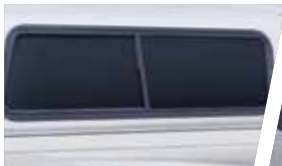
ALUMINUM FRAMED HALF SLIDER WINDOWS