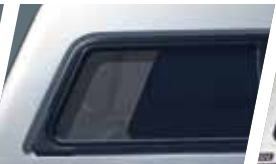
ALUMINUM FRAMED HALF SLIDER WITH CORNER FASCIA WINDOW