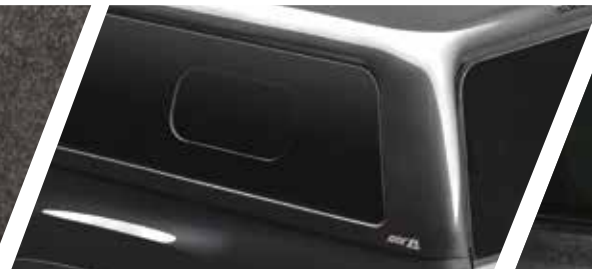
OPTIONAL FRAMELESS SLIDING WINDOW