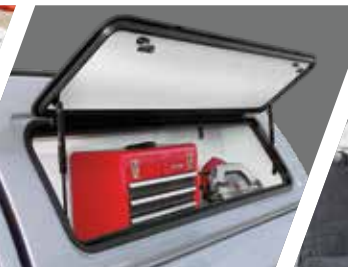
TOOLBOXES ARE ENGINEERED FOR MAXIMUM SPACE CAPACITY