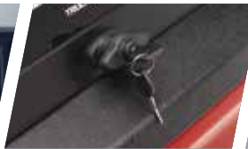
SINGLE T HANDLE