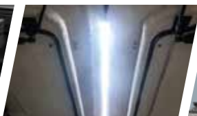
OPTIONAL RIVAL LED ENCASED ROPE LIGHT