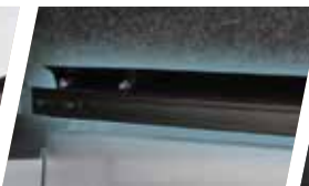
CONTINUOUS FRONT HINGE