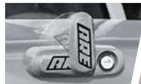
PAINTED PATENTED PALM HANDLE