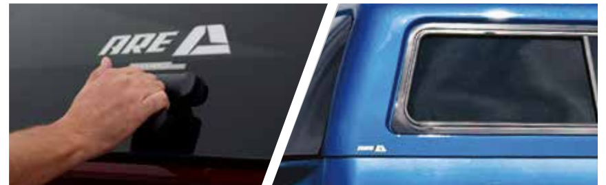
ONE MOTION™ INTUITIVE HANDLE