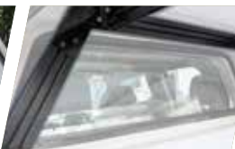
PATENTED STANDARD INTERNAL ALUMINUM SKELETON IS COMPLETELY UNIQUE TO THE CAP INDUSTRY