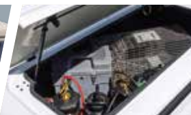
CONVENIENT SIDE ACCESS TO YOUR TRUCK BED

✓ = STANDARD FEATURES ■ = OPTIONAL FEATURES