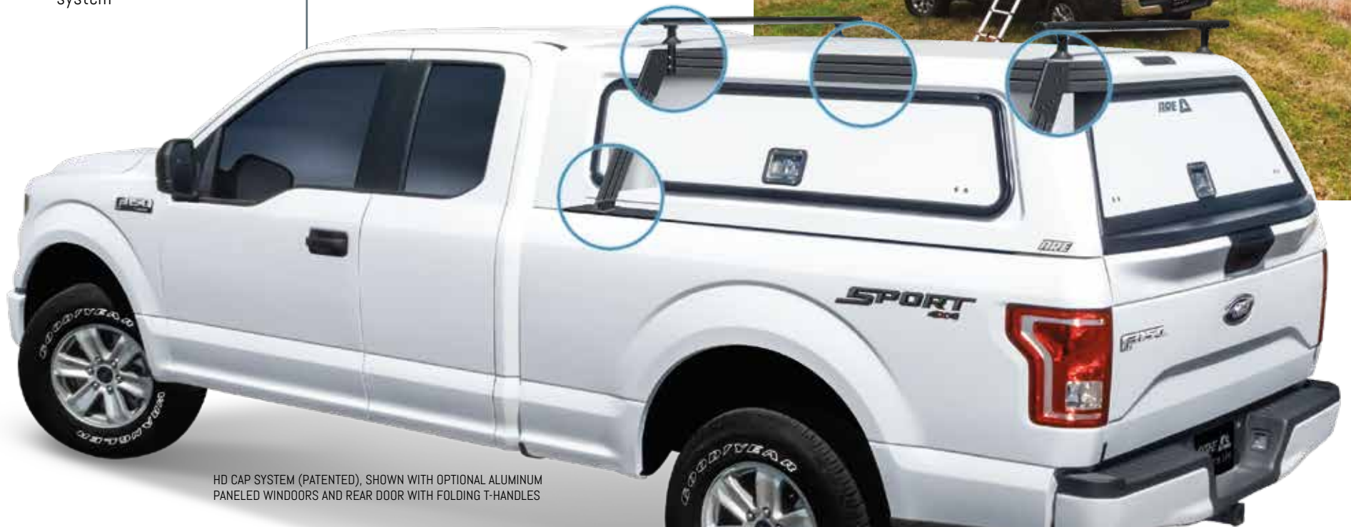
HD CAP SYSTEM (PATENTED), SHOWN WITH OPTIONAL ALUMINUM PANELED WINDOORS AND REAR DOOR WITH FOLDING T-HANDLES