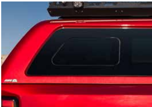
OPTIONAL FRAMELESS POP OUT WINDOW