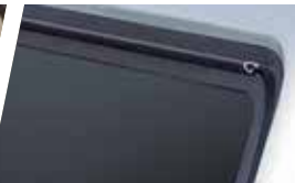
CONTINUOUS HINGE SYSTEM