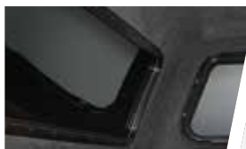
DARK GRAY HEADLINER