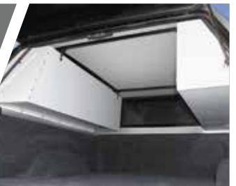
TOOLBOXES ARE SECURELY FASTENED TO ROOF FRAMEWORK