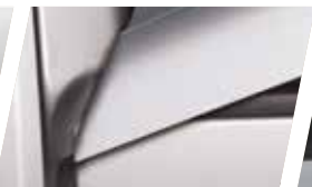
FRONT FITS DOWN AND OVER TRUCK BED