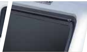
CONTINUOUS HINGE SYSTEM