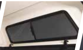
INTERIOR FIBERGLASS FINISH